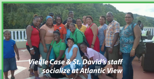
Vieille Case & St. David's staff socialize at Atlantic View