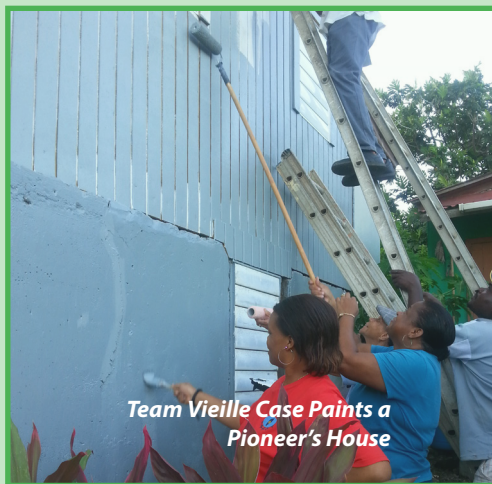
Team Vieille Case Paints a Pioneer's House