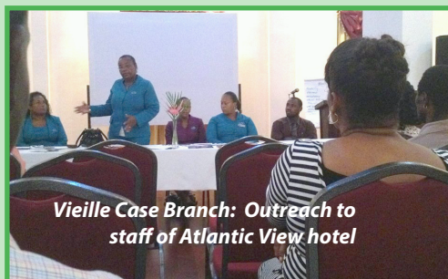
Vieille Case Branch: Outreach to staff of Atlantic View hotel