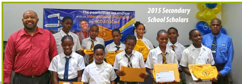
2015 Secondary School Scholars

Already in 2016, many individuals, organisations and causes have received assistance through our monthly donation and sponsorship program.