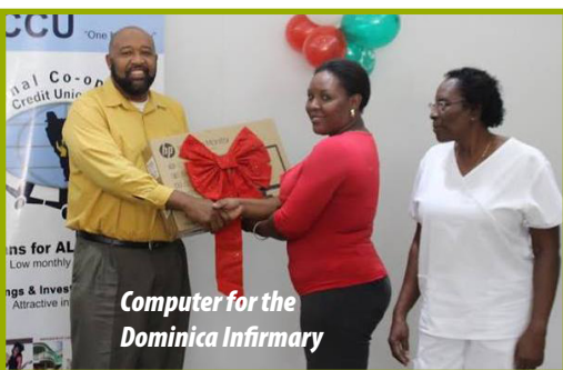
Computer for the Dominica Infirmary

Indeed it is a privilege to share our success with members and their families, the sick, needy, youth, older persons and our communities.